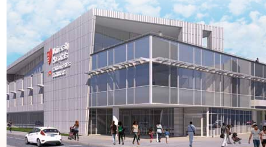
An architectural rendering of the UH Rainbow Center for Women & Children